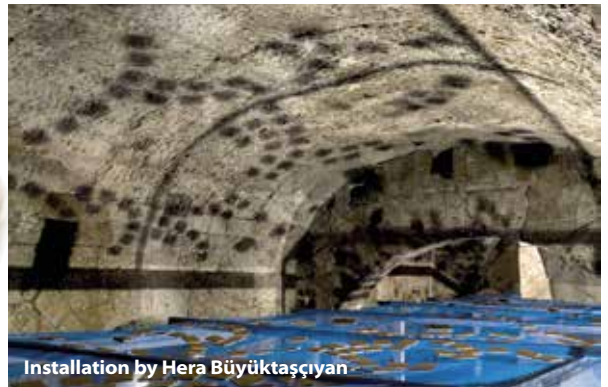
Installation by Hera Büyüktaşçıyan