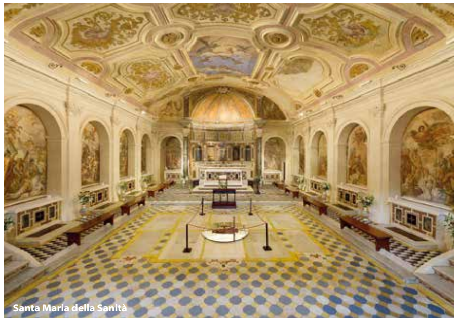
Santa Maria della Sanità

Until 17 January Museum complex of Santa Maria delle Anime del Purgatorio ad Arco. Via Tribunali, 39, Naples www.purgatorioadarco.it